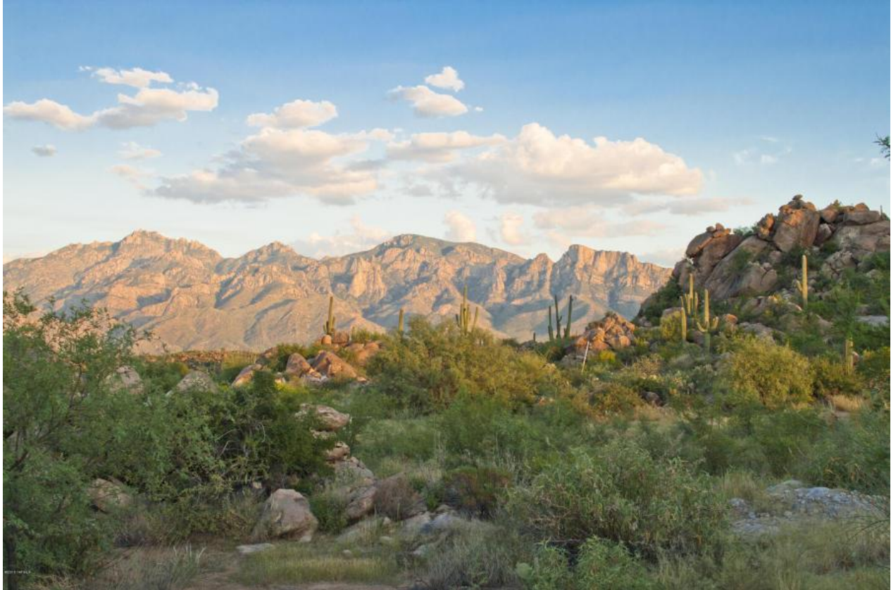
of a Stone Canyon custom lot listed by Team Woodall was sold

Now that you've made the decision to pursue a custom home, the next step is to begin shopping for lots. It's worth noting that while all real estate agents have the capability to represent a buyer when purchasing a lot, the vast majority of agents have little to no experience with land. Having an agent who's knowledgeable about all the many factors that go into a lot purchase, including the basics of the different purchase contract, is extremely important to successfully buying a custom lot. Any agent without experience in vacant land is simply working outside their area of expertise.